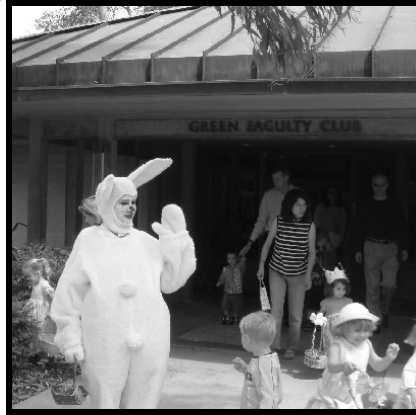
The Easter Bunny makes an appearance at the Club.