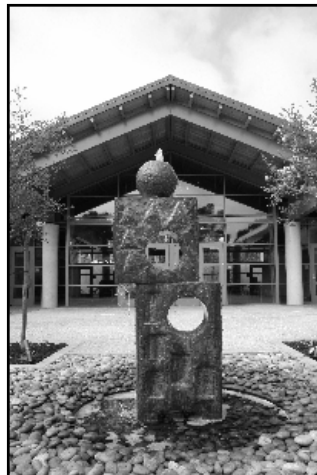
Meyers Fountain at the Atkinson Pavillion

Our new Atkinson Pavillion is ideal for conferences up to 100 people. Just ask us for details on how we can help you plan your Special Event. Recently, we hosted the Columbia University two-day conference. Guests stayed at the Estancia hotel across the street and were shuttled over to the Club.