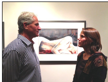
Guests interacting at the opening